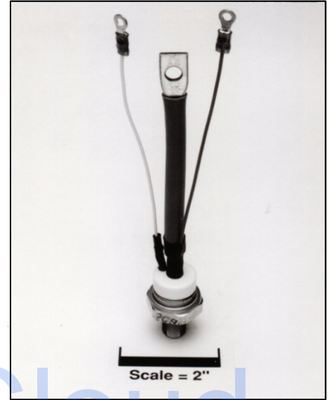
2N1909-2N1792 Phase Control SCR 70 Amperes Average (110 RMS), 600 Volts